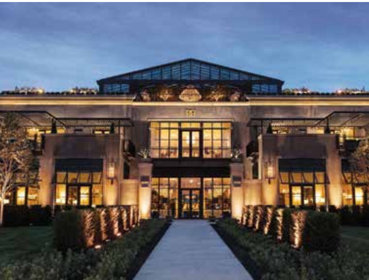
Restoration Hardware Showroom