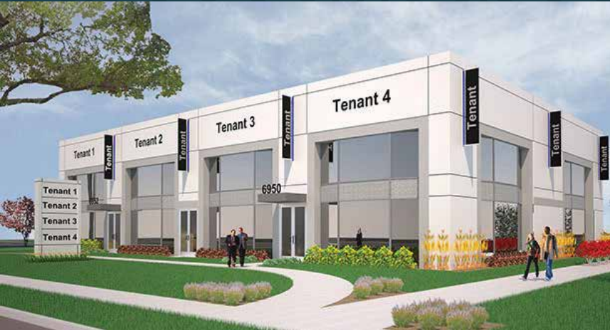
Luigi Bernardi 9,600 SF Retail development project