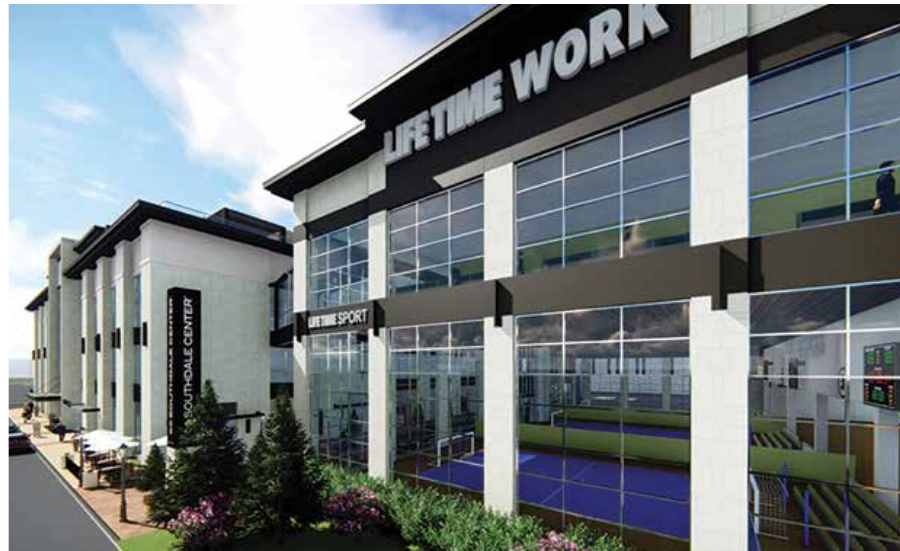
LifeTime Fitness - A new world-class fitness destination