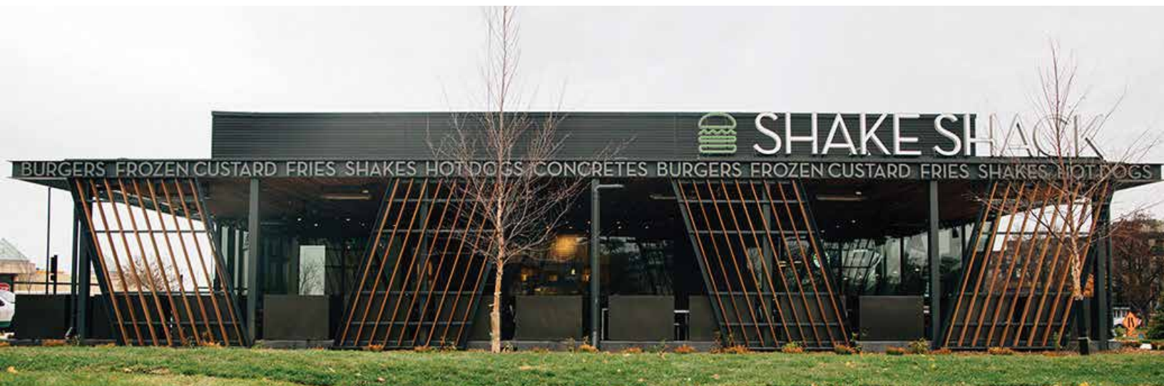
Shake Shack - great choice for quick lunch