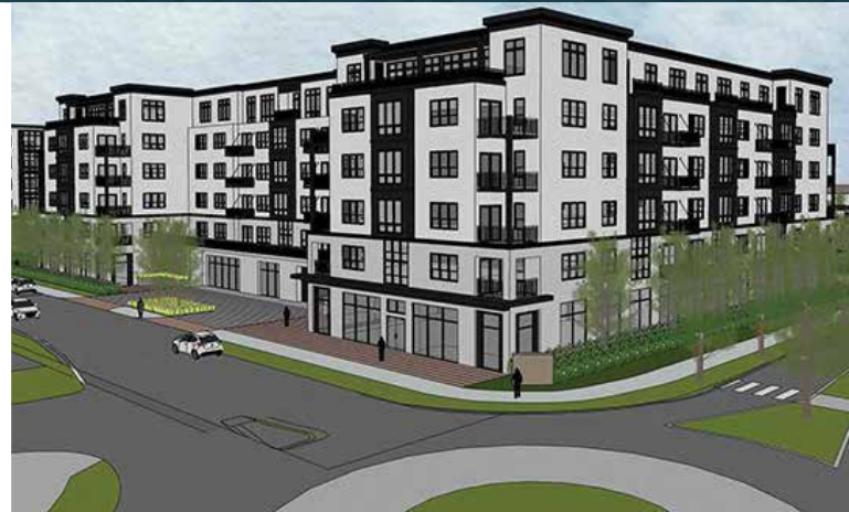
New 200 unit apartment building complex on U.S. Bank building site